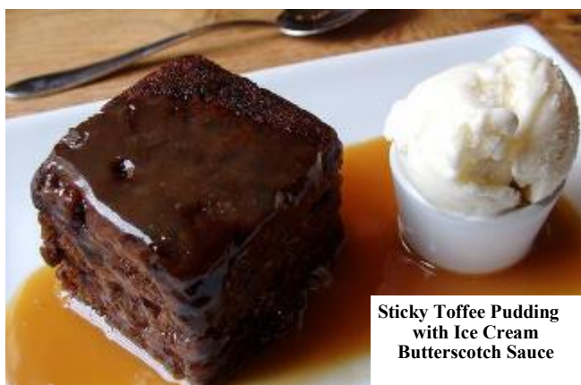
Sticky Toffee Pudding with Ice Cream Butterscotch Sauce

Booking form can be downloaded from SOCIAL EVENTS page of our website www.wrfa.org.uk or one comes attached to hard copy issue.