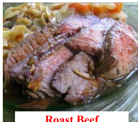
Roast Beef with red Wine Jus

Unless the Government is forced to amend the plan to ease restrictions imposed to deal with coronavirus pandemic the WRFA is booked to hold our first post-lockdown meeting and social event. This is planned for SUNDAY 1st AUGUST and it commences with coffee or tea served in the Wycombe Suite, Bowood Hotel, near Calne at 10.30am. The AGM will follow at 11.00am. A two-course Lunch will be served at 1.00pm.