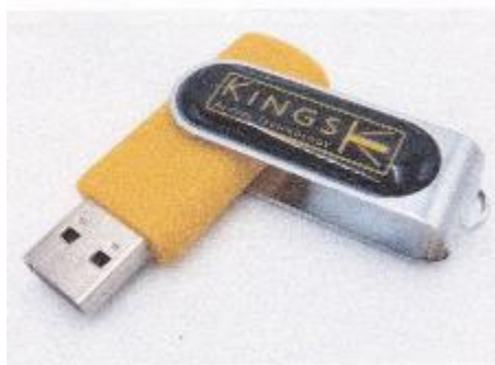
USB MEMORY STICK

Reading the website and the magazine is fine but you need to have enough vision to do so. It is known that some of our members have impaired vision making reading print difficult if not impossible and some have lost their sight completely.