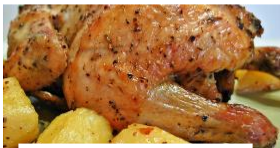
Roast Chicken & Bread Sauce , Thyme Jus

Booking form can be downloaded from SOCIAL EVENTS page of our website www.wrfa.org.uk or one comes attached to hard copy issue.