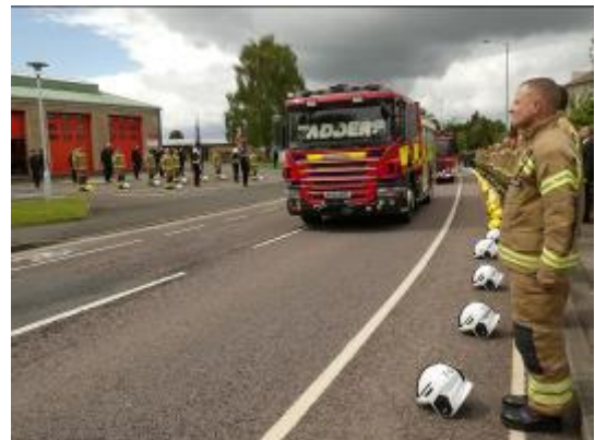
Funeral cortege passes Trowbridge Fire Station