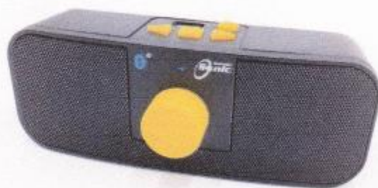
USB MEMORY STICK PLAYER