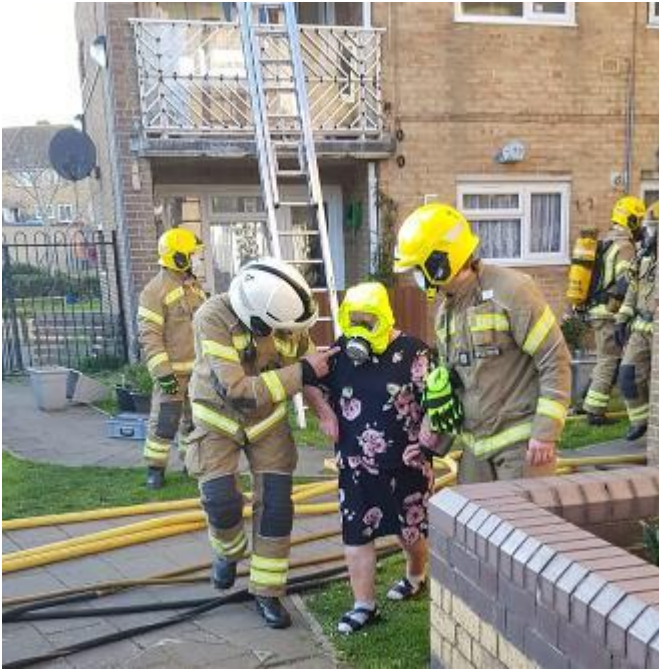
Fire escape hoods in use at a fire in Bournemouth

Life-saving equipment, brought in following recommendations from Phase 1 report of the Grenfell Tower public inquiry, has been used for the first time by Dorset & Wiltshire Fire & Rescue Service.