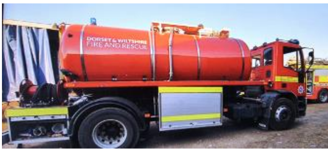
The 21st century version of a local Water Carrier

I was privileged to be appointed CFO in Wiltshire in 1986 and one of my first tasks in getting to know the brigade was to take stock of the appliance fleet. Something stood out to me like a sore thumb. There was not a single bulk water carrier in the fleet. This meant that the maximum amount of water any individual fire engine carried to a fire in Wiltshire was only 1800 litres (400