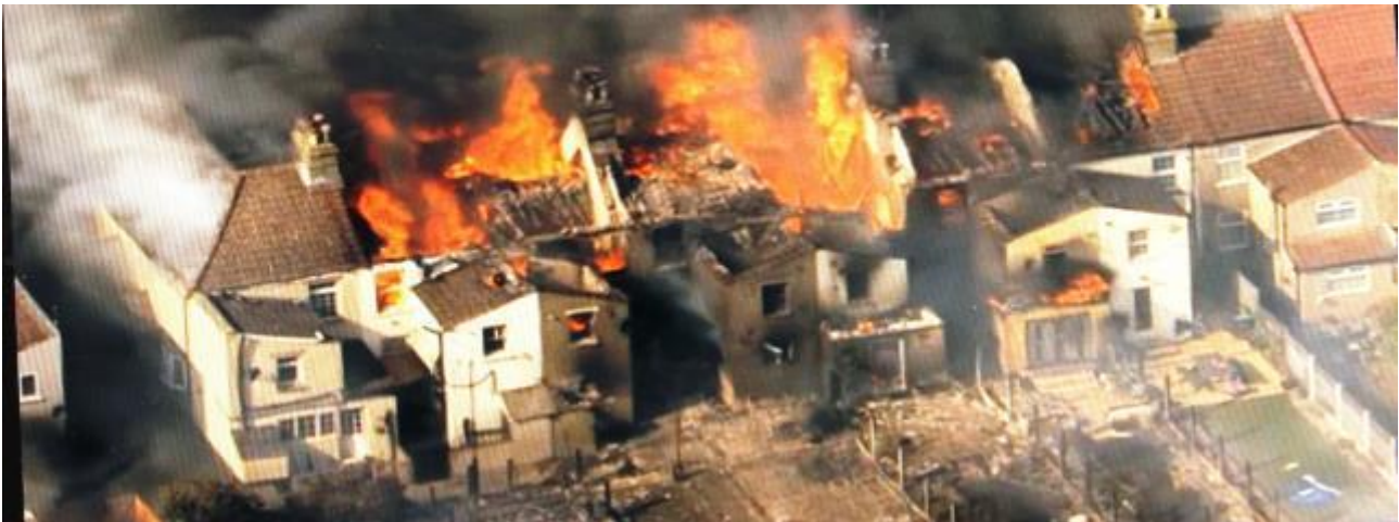
70 Wennington properties were damaged by fire. 19 were totally destroyed.

The weeks leading up to the super hot day were dry and nearly as hot bringing tinder dry conditions to fields, grassland and even private gardens. Wennington has a one-pump (wholetime) fire station within the LFB.