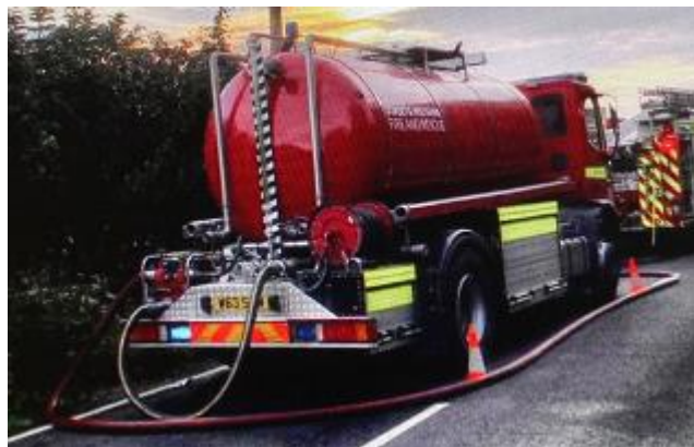
Rear view showing pipework and portable pump

The obvious need was to include purchase of water carriers in the Brigade capital programme but the fire authority members were already in a very sensitive mood about capital expenditure having been generous in their eyes to the WFB by allowing the funding of the new Brigade Training & Development Centre and then reluctantly accepting the need for an additional fire station for Swindon at Westlea.