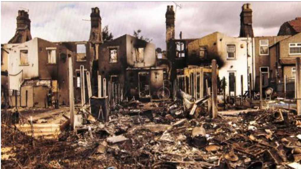
Four of the Wennington houses destroyed were not insured. The householders have been left destitute.