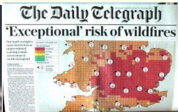
LEFT : A field fire blazes close to Stonehenge and the A303.