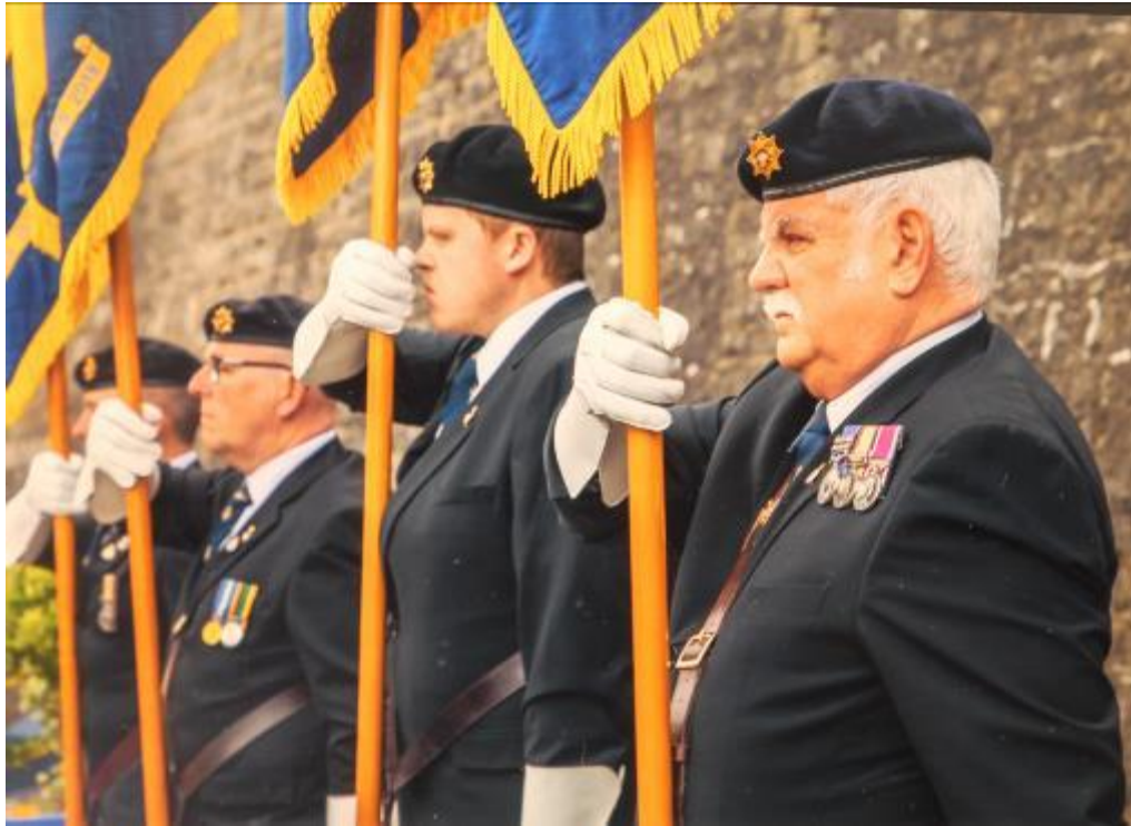
The Standard Bearers from four Royal British Legion branches attended