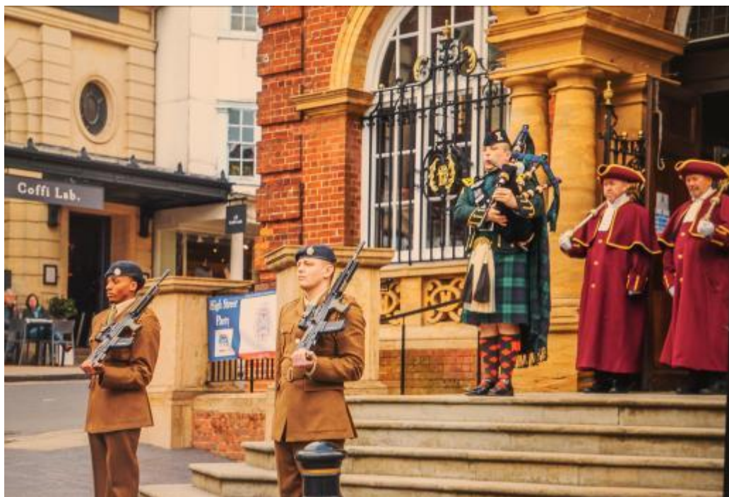
The Army provided a piper and an armed honour guard. The thoughts of all present must have been for those who died in the disaster and in recognition of the brave men of the Army, GWR and the NFS who spared the Marlborough area many more casualties and property damage.