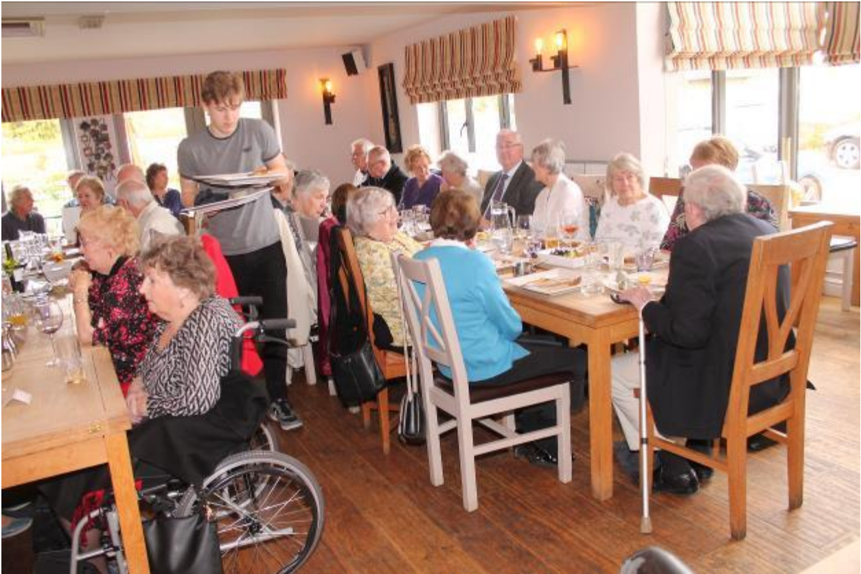
Car parking and disabled access was easy