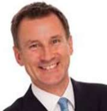
Jeremy Hunt MP

In his Autumn Statement delivered to the House of Commons on 22nd November, the Chancellor of the Exchequer, Jeremy Hunt, announced that the state pension will rise by 8.5% next April because the triple lock formula for calculating such rises was applied in full. This surprised some economists who have long argued that the triple lock is too generous and should be scrapped or at least amended. Pensioners can expect a £900.00 per year boost that will be very welcome in present circumstances.