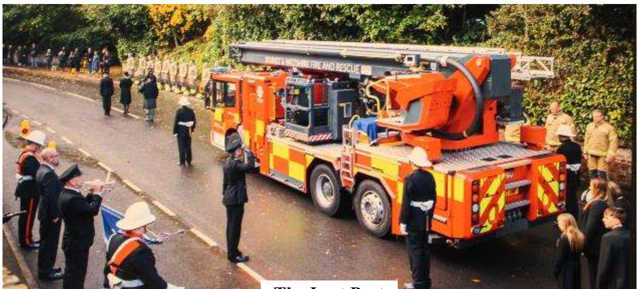
The Last Post