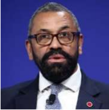
James Cleverly MP Secretary of State for Home Affairs

Recent affairs have done damage to the credibility of His Majesty's Inspectorate of Constabulary & Fire & Rescue Services. A valid question that taxpayers are entitled to ask is, “ Why have Dorset & Wiltshire taxpayers had to fund an independent inquiry into misconduct in the local fire & rescue service immediately after His Majesty's Inspector visited the service and gave it a grading of OUTSTANDING.? ” You don't have to be very intelligent to form the view that something is inadequate and inaccurate about the HMI's work.