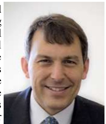
John Glen MP

Linked to the importance of collecting tax revenues fairly and efficiently is the need to ensure that taxpayer's money is being spent wisely by the public sector. To monitor the way the Civil Service is operating and oversee attempts to get the Whitehall bureaucrats to work harder and more efficiently the prime minister has appointed John Glen, MP for Salisbury, as Paymaster General and given him the task of reducing the sums spent by civil servants. In his Autumn Statement, the Chancellor heaped warm praise on the work John Glen is doing. The past experience of many assigned a similar challenge has led to their political career being wrecked by the powerful civil servants undermining and failing to co-operate.